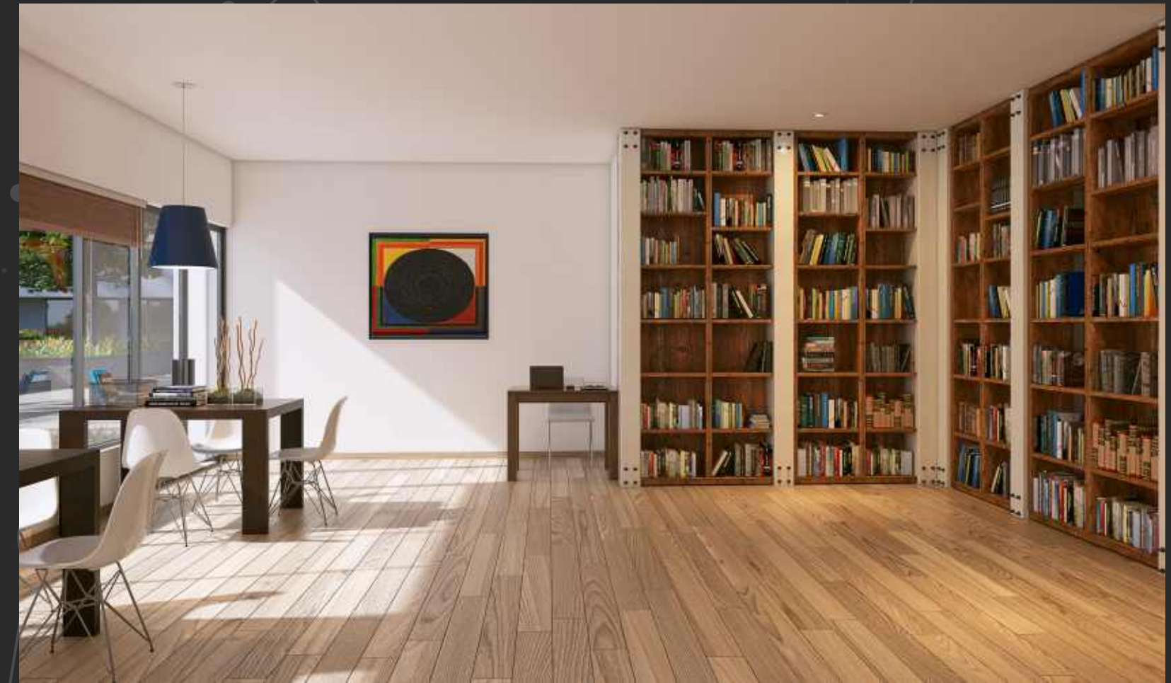
CATCH UP WITH SOME CLASSICS OVER A CUP OF COFFEE AT THE LIBRARY. FIND INNER PEACE IN A CORNER OF THE YOGA ROOM.