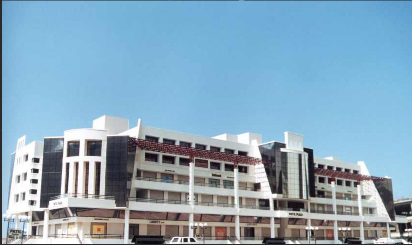
PATIL PLAZA ONE STOP SHOPPING