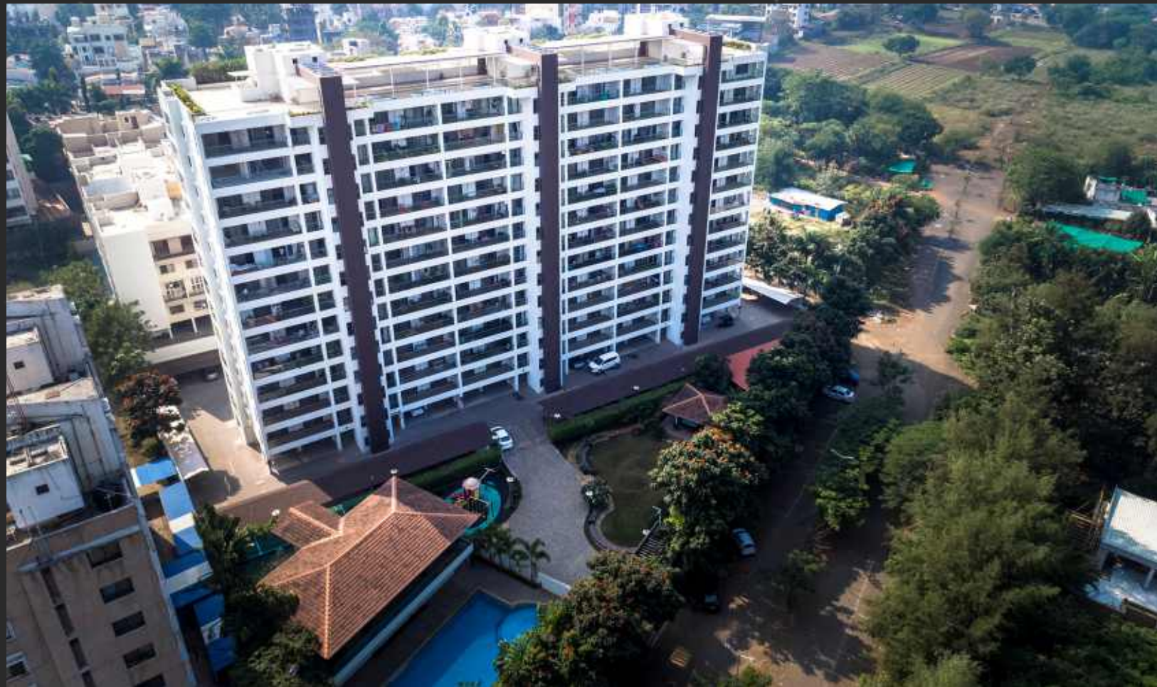
ekaant MOVE IN WITH NATURE