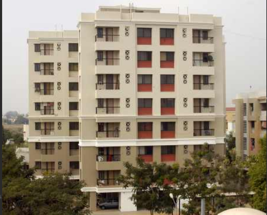
PATIL CLASSIC The Art of Fine Living!