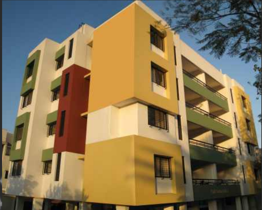
Patil Garden Luxurious Flats & Row Houses