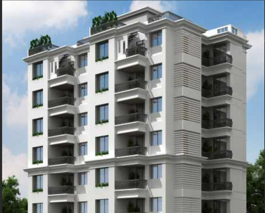
PATIL PARICHAY Your Dream