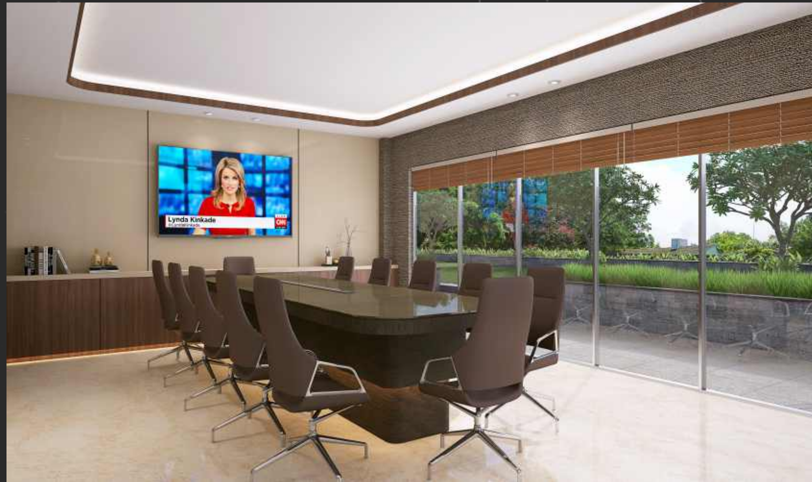
THERE'S PLENTY OF SPACE FOR MEETINGS, DISCUSSIONS, AND PLAYING INDOOR GAMES.